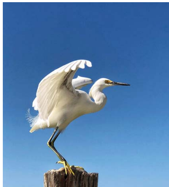
Great Egret Launching from pier piling Bill Shewchuk