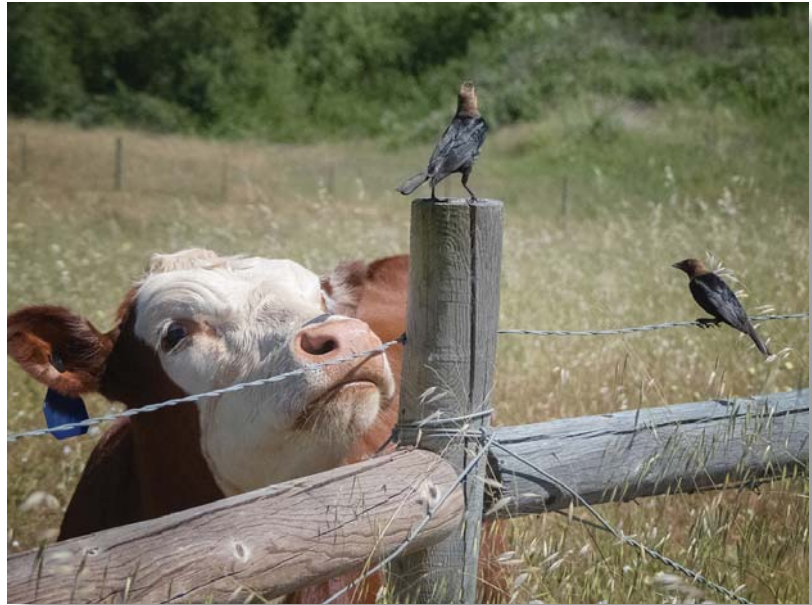
Curious Cow and Cow birds Amy Sibiga