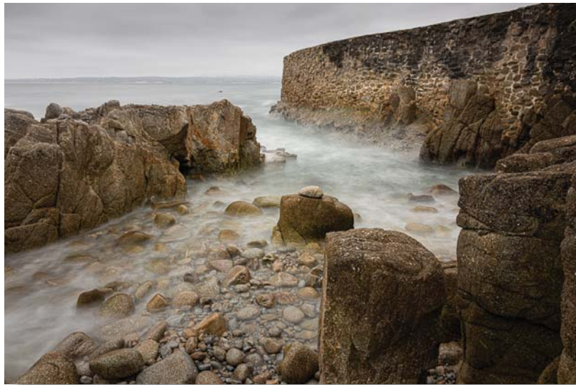
Beach Street Sea Wall Bill Brown